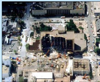
OKLAHOMA CITY BOMBING

PURPOSE — Research outcomes will not only increase the nation's capacity to respond effectively to high consequence events, but formal and informal responders will be able to better anticipate human perceptions and behaviors capable of upsetting disaster response efforts. Furthermore, our research will strengthen awareness of IRN capabilities and formal integration of these resources to augment the National Response Plan, which will lead to increased hospital surge capacity.