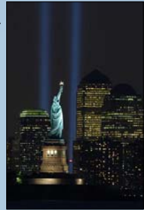
WORLD TRADE CENTER ATTACKS

BACKGROUND —This research is supported by the Dpt. of Homeland Security National Center for the Study of Preparedness and Catastrophic Events Response (PACER), established to address the technical, systematic, behavioral, and organizational challenges posed by various all-hazards threats. Informal Response Networks (IRN) consists of organizations and organizational linkages which normally exist for purposes other than contributing to disaster relief efforts. For this research, IRNs include community-based organizations, faith-based organizations, and private businesses. IRN-capabilities and IRN-response effectiveness have not been quantified, but scientists generally agree that IRNs have the potential to significantly enhance overall surge capacity (Figures 1 & 2). This DHS-funded research will measure the disaster response capabilities and needs of willing IRNs, and formally integrate IRN-capabilities with Formal Response Networks (FRN), such as DHS, Public Health, Healthcare, EMA, Fire/Police, Red Cross, United Way, etc. Our research will also explore the potential impact of human perception and behavior on response effectiveness.